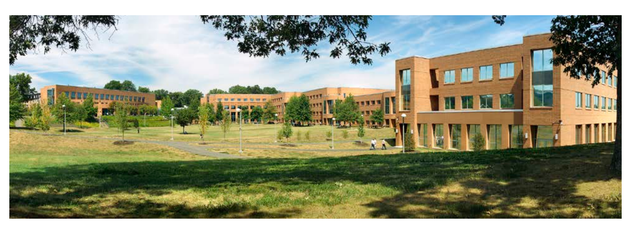
The Department of State George P. Shultz National Foreign Affairs Training Center in Arlington, Virginia - the US Government's premier foreign affairs training provider.

Important ancillary benefits are achieved by involving US business in designing and conducting CD training programs, such as: